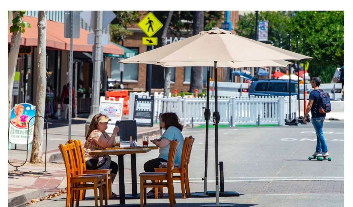
a skateboarder rolls by, diners sit at a table beneath an umbrella along a closed Glassell Street in Orange just south of the Plaza on Friday morning, July 10, 20 The closed street has allowed restaurants to move seating outdoors for social distancing during COVID-19 and be open for business.