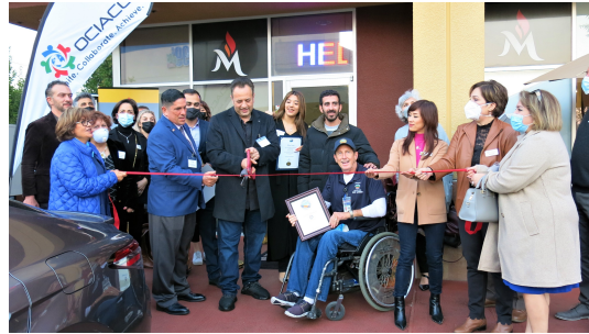
Congrats to the family-owned M Cafe & Grill on its grand opening in Lake Forest. Address: 22611 Lake Forest Dr c2, Lake Forest, CA 92630