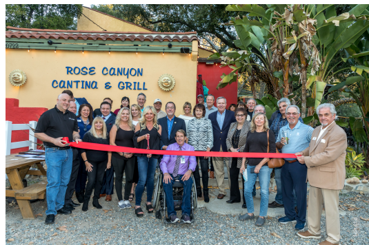
Congrats to Rose Canyon Cantina on its grand opening in Trabuco Canyon. Address: 20722 Rose Canyon Road, Trabuco Canyon, CA 92679