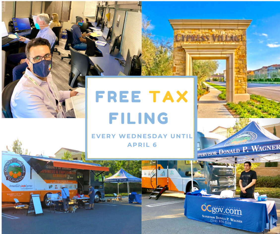
Photo: Mobile One-Stop Unit with 12 work stations