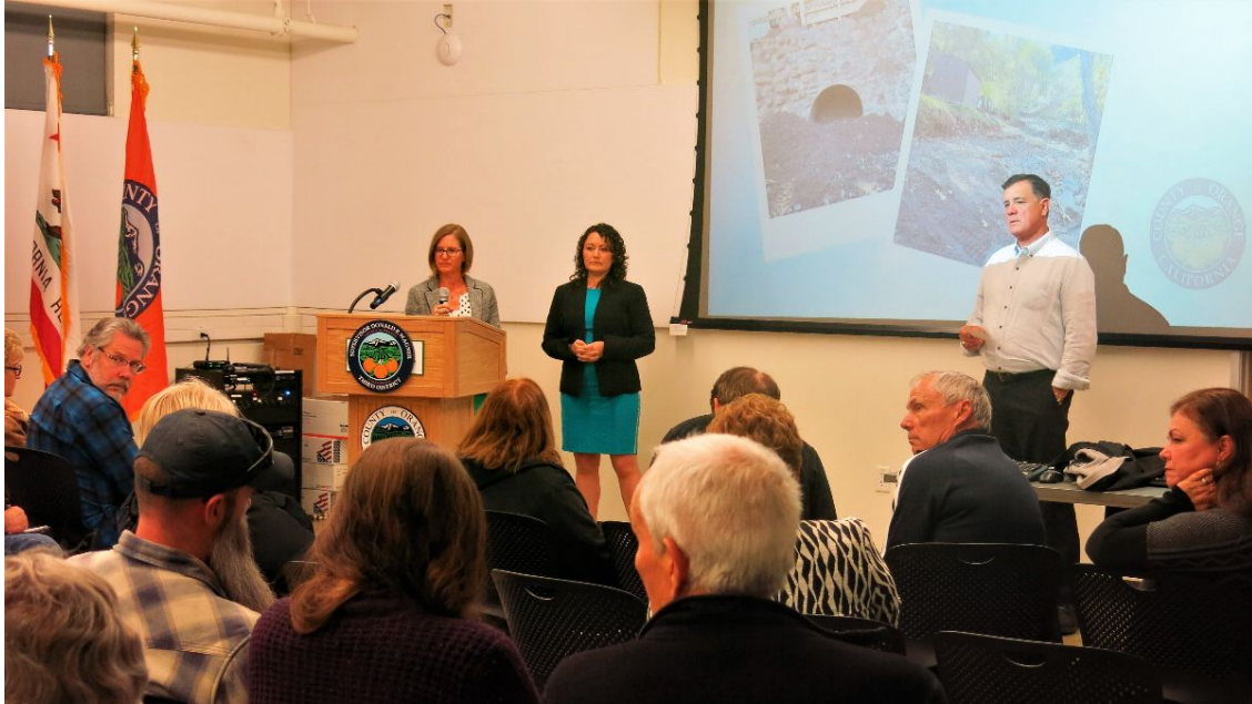
Canyon Community Town Hall