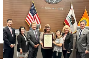
October is National Bullying Prevention Month