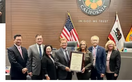
October is National Disability Employment Month