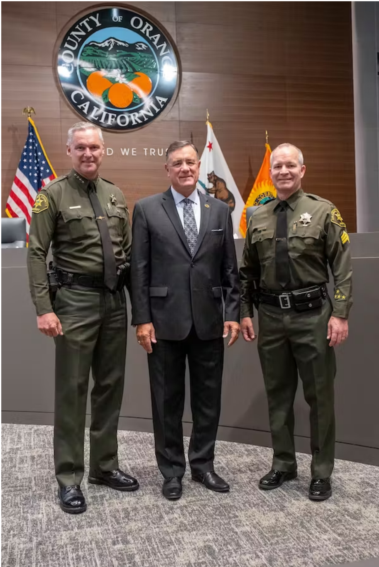
3. Above the Influence Program