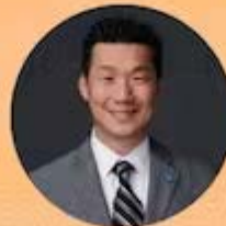
JORDAN WU VILLA PARK COUNCILMAN