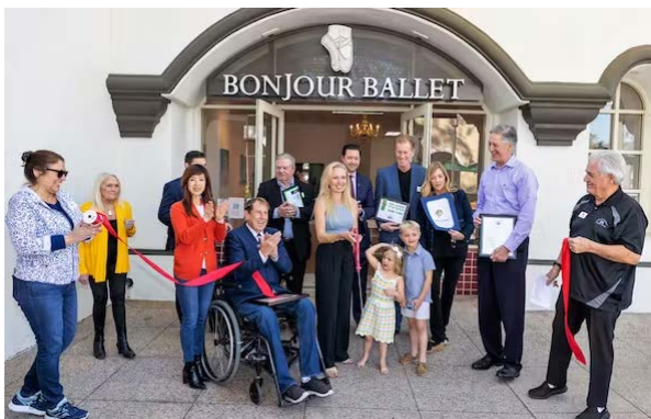
Bonjour Ballet Grand Opening: Rancho Santa Margarita