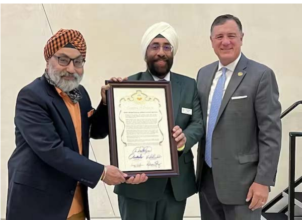
Sikh Appreciation Month: Chapman University Interfaith Center