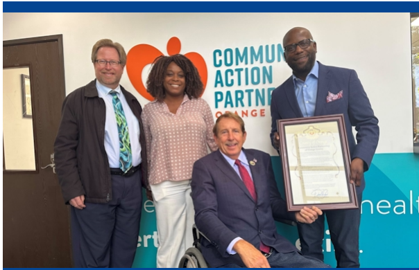
Recognizing Community Action Month with CAPOC