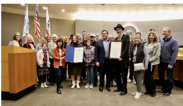
Celebrating Jewish American Heritage Month with the Chabad Jewish Center of Mission Viejo