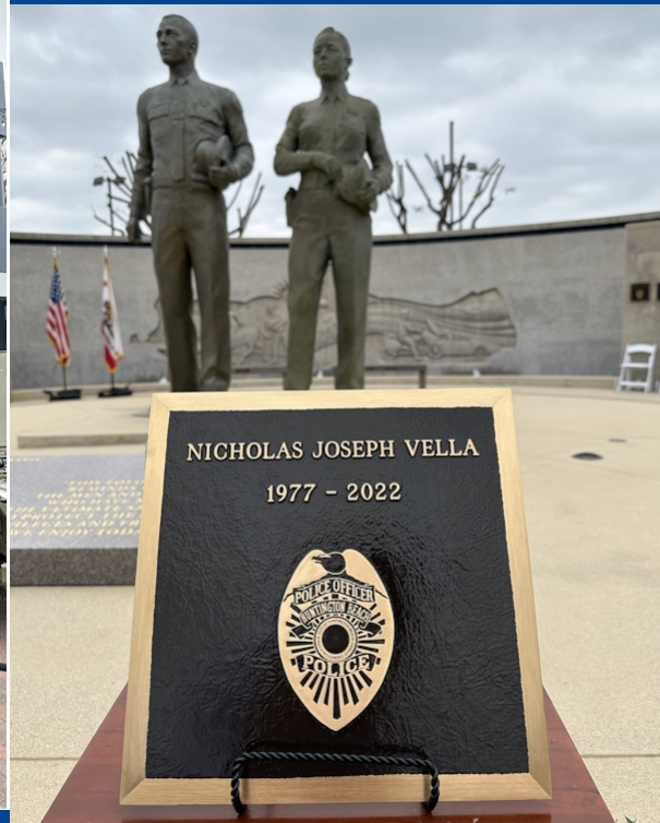
Orange County Sheriff's Advisory Council's Peace Officer's Memorial