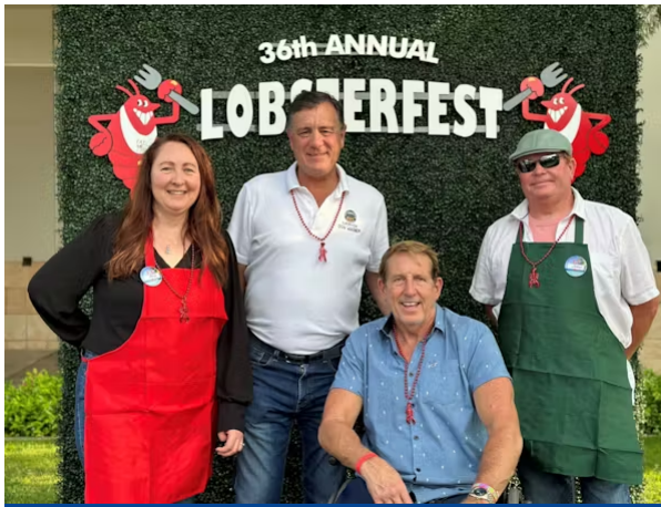
Supporting the Yorba Linda Sunrise Rotary Lobsterfest