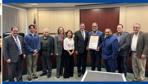
Celebrating Community College Awareness Month with Rancho Santiago Community College District