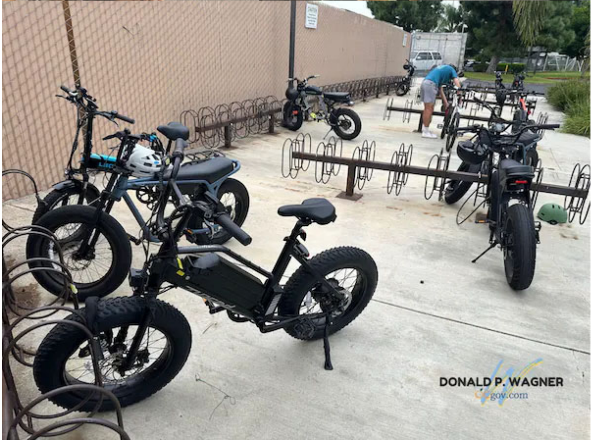
Earlier this month, I joined the Irvine Police Department and Irvine Unified School District for e-vehicle safety presentations for the students of Irvine High School and Northwood High School. We discussed the differences between e-vehicles,