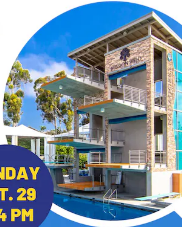
Marguerite Aquatics Complex Mission Viejo